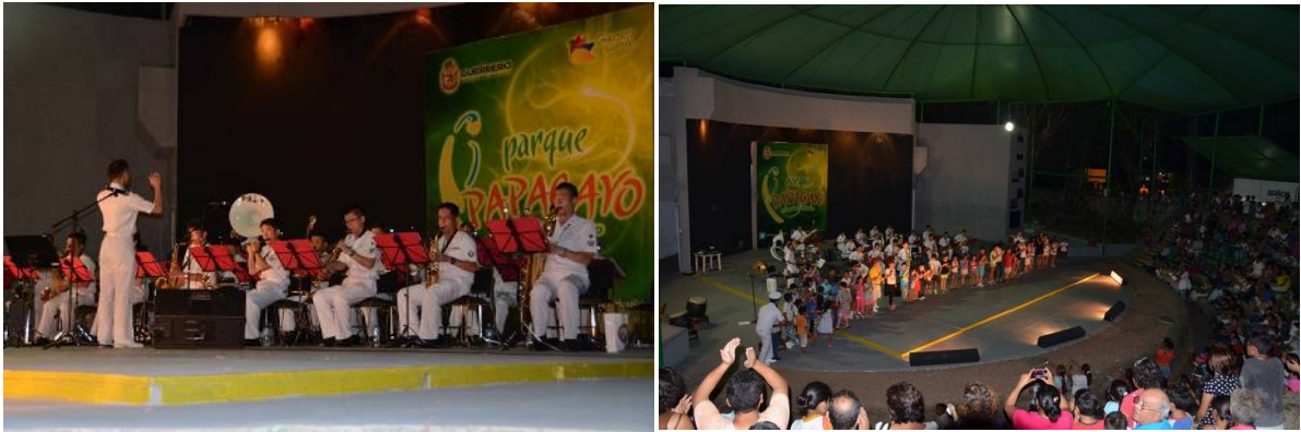
(Photo: Performance by the Japan Maritime Self-Defence Force Training Squadron Bands)

The Japan Maritime Self-Defence Force Training Squadron Band has performed during numerous port calls around the world. On these occasions the Band's performances have attracted large local audiences and media coverage as is evident in the photos below. We encourage you to come and hear these two professional bands play.